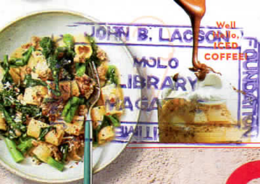
WEEKNIGHT DINNER in a Flash