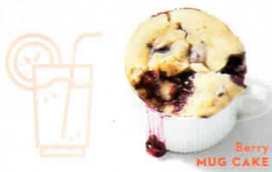
Berry MUG CAKE

48 things to EAT, COOK, SIP and SERVE P 86